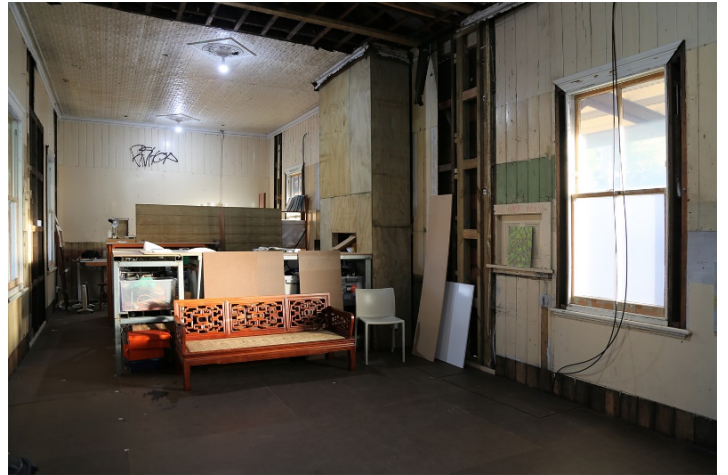
Studio 3 – shared studio space