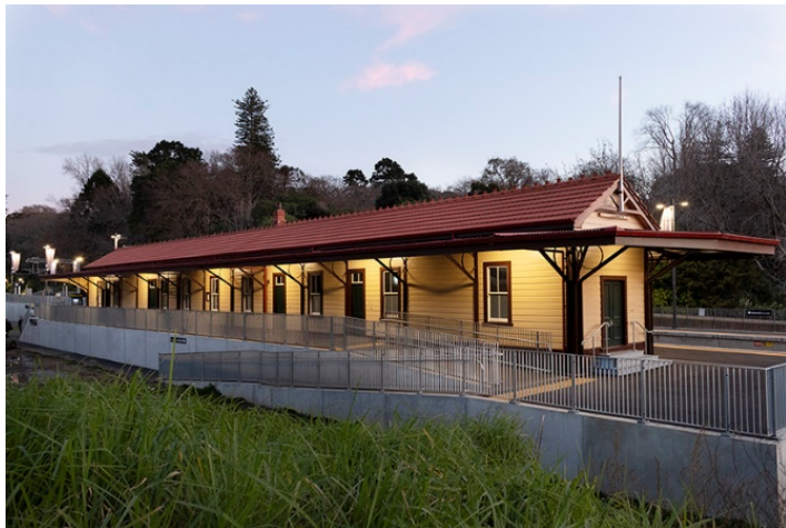
Te Tuhi Studios at Cheshire St